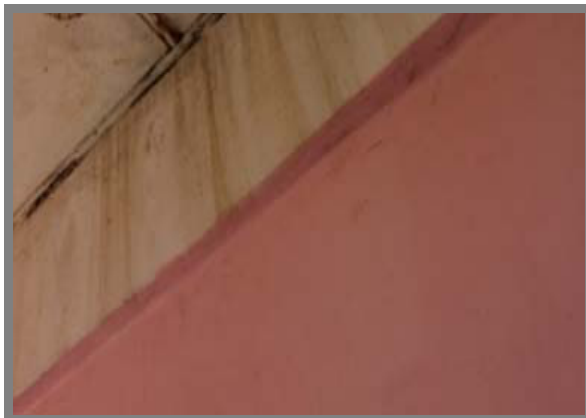
Figure 1: Penetrating damp on the ceiling.

Dampness in schools resulted from water incursion either from internal sources (e.g. leaking pipes) or external sources (e.g. rainwater). This defect became a serious problem when various materials in the school buildings became soak for extended periods of time. Besides, excessive moisture in the air due to poor air ventilation system inside the buildings can also lead to dampness [10]. The common type of dampness found in school buildings is penetrating damp. Dampness was found on the ceiling and wall due to the ingress of water. The classrooms, especially on the top floor, were greatly affected by dampness of ceiling as the roof tiles were missing or blown away by wind. The rainwater penetrated directly into the building itself, resulting in dampness (Fig. 1).