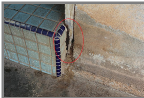
Figure 3. Timber decay on door frame in toilet.

Timber was widely used as a building material in most Malaysian school buildings. However, this type of material can be deteriorated easily due to several reasons, such as aging, dampness or wear and tear [8].