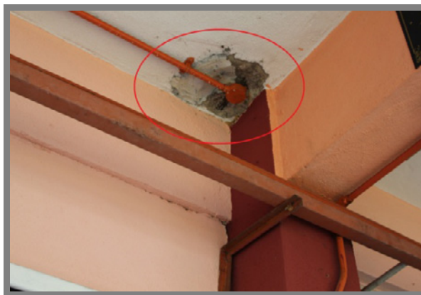
Figure 6: Broken plastered renderings.

Most of the roof systems constructed in each school buildings were pitched roof system. However, there were still flat roof systems in some school buildings. Roof is an important element in a building as it protects the interior from the external weather, such as rain, sunlight and wind [7]. Different types of roof covering materials were used in each school, such as asbestos, zinc sheets and roof tiles. From the inspections, the roof defects found were the blocked gutters, leaking downpipes, leaking roofs, missing roof tiles, slipping roof tiles and also defective soffit and fascia board. The causes of blocked gutters were the growth of plants and accumulation of leaves and debris. The roof tiles had been put downward towards the gutters and the growth of plants consequently blocked the runway of rainwater. As the result, the rainwater will overflow when there was a heavy rain. However, it was also discovered that gutters were not constructed along during the construction stage at some of the school buildings.