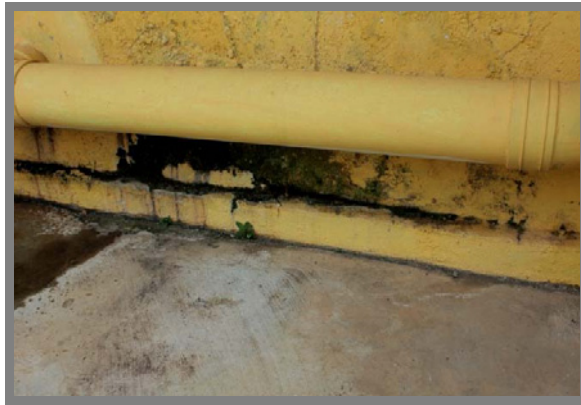
Figure 2: Mould growth on wall caused by dampness due to leaking pipe.

Dampness can arise from unintended water caused by leaking pipes, gutters and flashings [10]. The leaking water penetrated into the wall, resulting in horrible water stains. Under long term of dampness penetration and poor ventilation within the building, excessive moisture promoted the growth of mould on the surface of wall (Fig. 2).