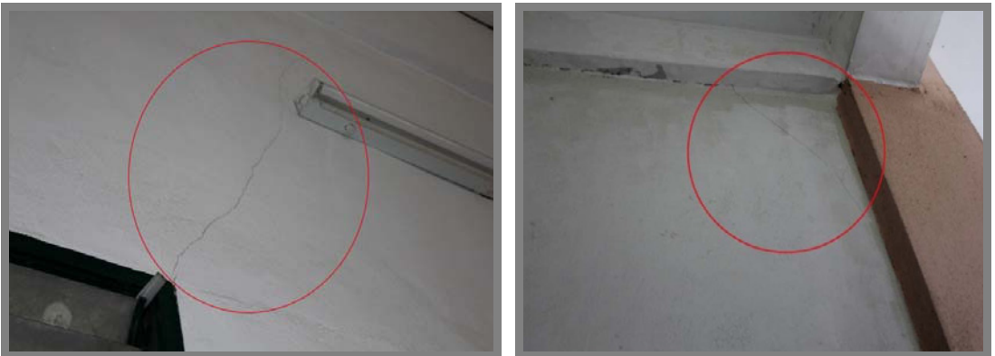
Figure 5: Diagonal crack on wall and at the corner of door

Some parts of the inspected schools showed serious cracks while some only showed minor cracks. From the inspection, cracks in wall were in various directions and varying in width from fine hair cracks to 5mm or more. The hairline cracks in plaster and other finishes affected the appearance of the structure but fortunately did not pose any safety concern [7]. There were long and continuous cracks across the walls, beams, columns, ceilings and floors. Moreover, a diagonal crack was found at the corner of door where the crack tip was very thin with increased thickness at the initial point.