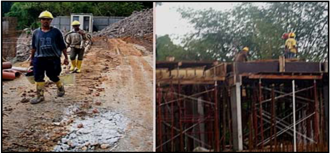
Figure 4: Labours at SP Setia site (traditional construction)

Through the case studies, significant differences in terms of the workforce utilization can be observed. In fact, one would be able to discern whether a project was deploying the IBS or the traditional approach by casting a single glance at the construction site during working hours. Construction is a labour-intensive industry, especially in conventional construction. With an overall mean score of 3.10, the IBS application is able to reduce labour at the construction sites. Pre-cast construction method (IBS) is a relatively less labour-intensive method, but it still requires skilled labours to perform on-site work such as the installation of IBS components. This explains the minimal number of labours because they are only engaged for the installation of the IBS components [14]. Contrary to conventional methods which require more labour to complete work such as formwork fabrications, reinforcement bar or steel cage fabrications, formwork installations, reinforcement bar installations, concrete placements and formwork dismantling; the use of the IBS method will reduce the dependency on foreign labour. However, the use of skilled labour is needed for the installation of mechanical equipments and components that involves heavy machineries like cranes at construction sites. Fig. 4 shows, traditional construction methods had involved more construction workers on the construction site.