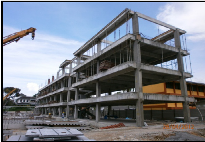
Figure 3: Erection of IBS Structure Component at Sekolah Kebangsaan Minden Heights

This study was conducted through case studies, questionnaires and interviews. Respondents involved are builders from the four construction sites around Penang which had been visited.