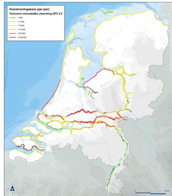
Figure 1. Proposed new flood protection standards in terms of maximum acceptable failure probability of embankment stretch [17, 22]

In hindsight, we may conclude that the new standards are thus based on a possible future socio-economic and climatic situation, which could be qualified as a 'high end scenario' from a flood risk management perspective. This is rational in the context of exploring how big the problem to face might be, but it is quite a challenge to match this with the government's claim to have adopted a policy of adaptive planning and management. We shall explore some possible consequences for reinforcement planning and make some suggestions on how one might proceed in practice.