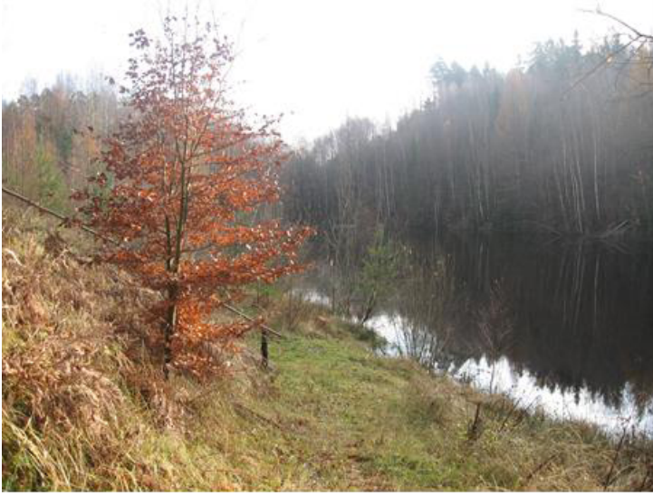
Fig. 3. The anthropogenic reservoir (“The Silent Lake”) in a sink-hole created as a result of underground exploitation - saddle No. VII; photo by G. Galiniak.

When analyzing the effects of previously conducted reclamation works, a preliminary analysis, based on a limited range of physical and chemical parameters, of the chemical composition of water from the reservoirs created in the post-mining terrains, was performed. In total, water from eight different reservoirs, representing the previously-mentioned types, was analyzed (Fig. 4). The samples were equally split between the classes. In the case of two biggest ones, with depths, determined by probing, exceeding 5.0 and 7.5 meters, multiple sampling was used as three samples were collected: from the bottom, middle, and near-surface zones. For the sake of comparison, an additional sample was collected from a well drilled for mine supply, filtered within the Quaternary aquifer (Fig. 4).