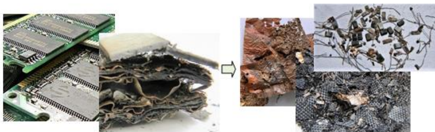
Fig. 2. Direct steam gasification of the RAM waste [15] (general illustration).

Taking into account total volume and composition of electronic wastes it seems, particularly from the Circular Economy point of view, that not gaseous product (syngas) but inorganic residue, especially metals, should be in the first place recovered. We believe, that direct steam gasification is a promising method of this recovery. It was demonstrated first time for the RAM waste, the data storage device comprising of FR-4 board and set of integrated circuits [21]. The original item, the crude product of gasification and some of materials which were the result of simple physical separation of the product are presented in Figure 2. Finally, 6 fractions were gathered: (from the integrated circuit) 1.1 – dies, 1.2 – ferromagnetic elements of leadframes, 1.3 – residue of encapsulation and (from PCB) 2.1 – copper foil, 2.2 – coarse metallic elements, 2.3 – fine fraction. Concentrations of some, typical for electronic waste metals in these fractions are presented in Figure 3. The differences between fractions and high level of precious metals are evident. There was also almost no char in the residue after gasification of organic fraction – epoxy resins.