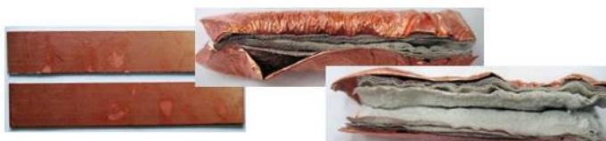
Fig. 4. Steam gasification of a raw FR-4 board [A. Zielińska, Laboratory of HT Processes, W7/PWr].

Figure 4 is a good illustration of effectiveness of the steam gasification process for electronic waste. Gasification experiment was performed in a quartz reactor with samples of the raw FR-4 board at 860°C for few hours [A. Zielińska, Laboratory of HT Processes, W7/PWr]. It may be noticed that the structure of the board was fully opened and the epoxy resin, which bonded fiber glass and copper layers, was completely removed.