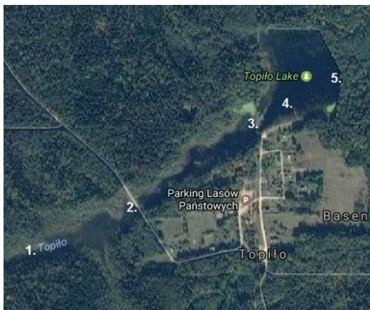
Fig. 1. Location of control points within Topiło Lake [6].

Studies were conducted in two different catchment areas. Topiło reservoir, located in Podlasie area in the south-east of Białowieża Forest, has typical sylvan catchment. It was built in 1932-1933 as a wooden logs store, but in 1975 tank was excluded from this type of use. Topiło Lake catchment area with Perebel River involves Białowieża Forest and Hajnówka urban area. Topiło location bears on industrial and municipal pollution character. Reservoir has 21.1 ha water surface and only 1 m of average depth [5].