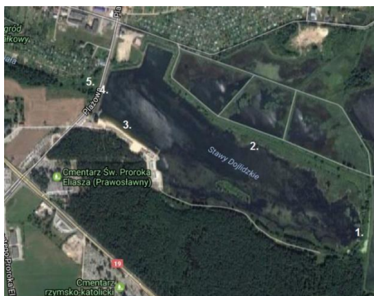
Fig. 2. Location of control points within Dojlidy [6].

Second reservoir, Dojlidy, is located also in Podlasie area, in the south-east of Białystok as a part of Dojlidy Ponds. In contrast to Topiło Dojlidy, with 34 ha and 1.75 m average depth, has agricultural catchment. It was built in 1962 by damming Biała River. The research object is being used as a swimming pool, but in the period of the study it was excluded from this type of use because of modification works made by the Water Sports Centre “Dojlidy”. It is also a place for extensive, non-commercial fish farming. In addition, the reservoir has the task of regulating water surface runoff [7].