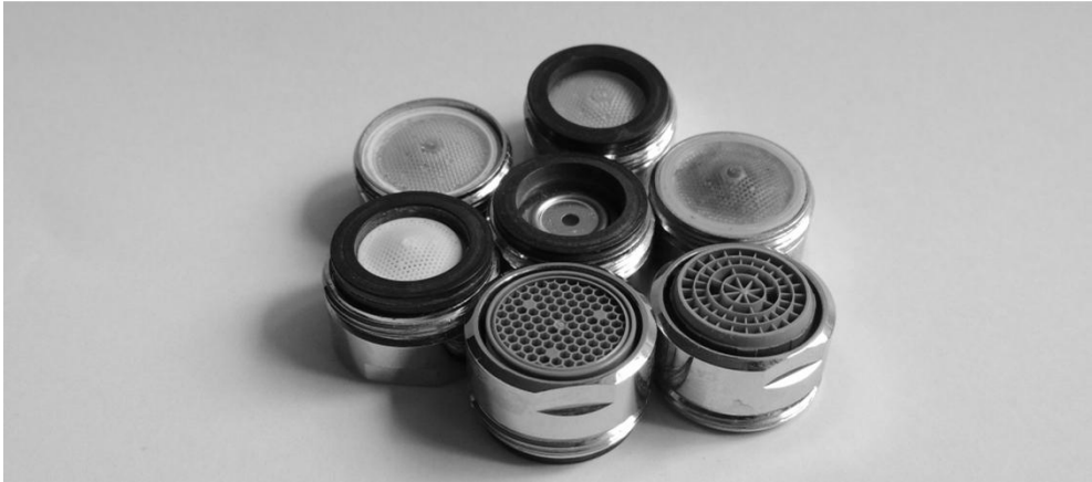
Fig. 2. All water-saving products used in the tests performed

At the present time very rarely occurrence of faucet without an aerator. In addition, the outflow from the tapware without any aerator and flow regulator showed some changes in subsequent tests. For these reasons, the reference level in the calculation was the outflow of the fittings provided with the old used water saving product. This has minimized the effect of pressure changes on the results obtained, since all flow regulators (including old product) were almost pressure independent.