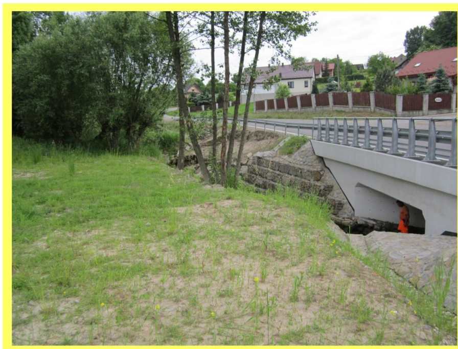
Fig. 3. Culvert on the upstream side and the view of damages