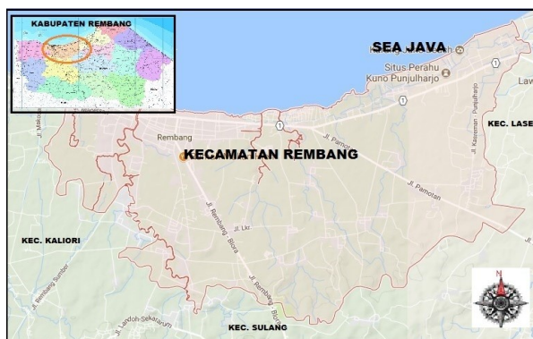
Fig. 1. Rembang District Map

Based on data from the Regional Government of Rembang Regency, the area of Rembang District 5,881 Ha with District road length of 77.9 Km.