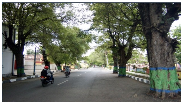
Fig. 2. The Javanese Tamarind plant head covering the area of the road