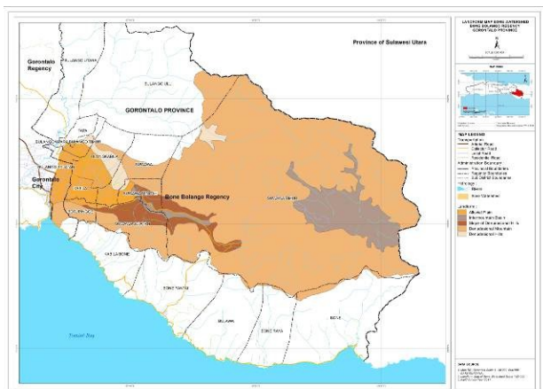
Fig. 4. Landform Map

Landform in the study area, as can be seen in Figure 4 Consist of alluvial plain, intermountain basin, the slope of denudational hills, denudational mountain, and denudational hills. The landform became one of the important data inputs in this study because the landform is closely related to topography, parent material, and soil type hence it plays an important role in agricultural planning.