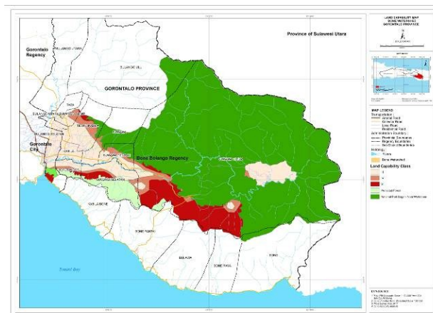
Fig. 5. Land Capability Map

Land capability analysis is conducted to evaluate the potency of land for sustainable long term use. Result of land capability analysis can be used to support decision making for sustainable development in agriculture sector. Land capability assessment is used to determine land management to prevent land degradation both longterm conservation and type of land utilization[7]. Land capability analysis utilize topography data, soil properties data, and risk hazard data. Result of land capability in this study is presented in Figure 5.