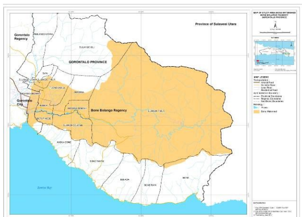
Fig. 1. Map of Study Area

The study area is Bone Watershed, as can be seen in Figure 1 located in Bone Bolango Regency, Gorontalo Province, Indonesia which covers an area of 1017.55 km 2 . Geographic coordinate of the study area is 0° 23' 48.26" N to 0° 42' 18.354" N and 123° 3'45.522" E to 123°32'56.235" E.