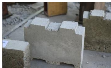
Fig. 5 (b). Samples of interlocking block concrete.