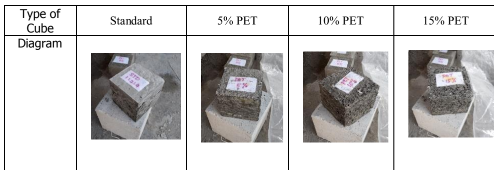
Fig. 2. Concrete cube with 0 – 15% PET.

Curing is the process to avoid the water content in the concrete evaporates quickly by hot weather. The concrete was put in a damp at least 7 days after it harden. Rather the purpose is to show that high-performance concrete has to be water cured as early as possible, late curing is of partially no value, but is still better that no curing at all, total shrinkage can be drastically reduced by appropriate early water curing and no water curing at all can be catastrophic [11]. Figure 2 shows concrete cube with 0 – 15% PET.