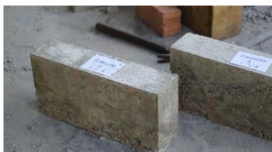
Fig. 5 (a). Samples of standard block concrete.