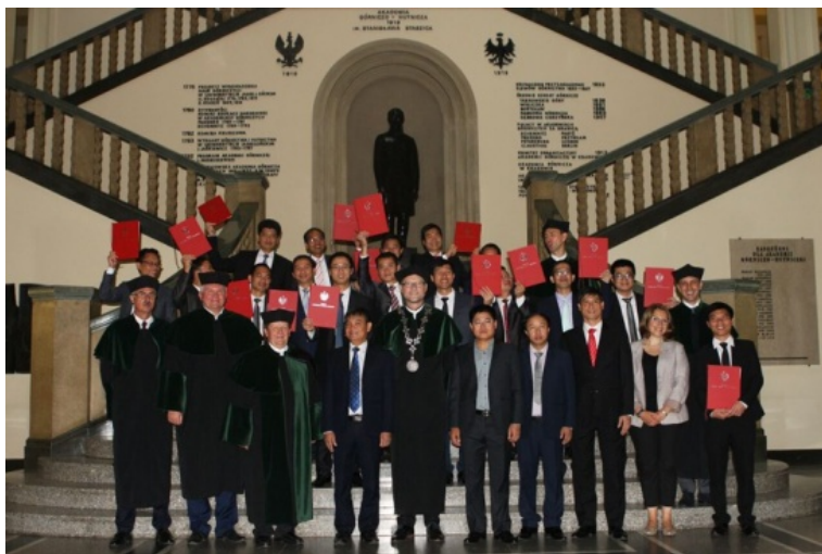
Fig. 2. Staff of Vinacomin received their master degrees of ventilation from AGH Krakow in July 2017. Two of them will be chosen for doctoral program

Being one of the biggest employers of Vietnam industry, Vinacomin aims to send staff to Poland, studying ventilation and safety management in master and doctoral degrees, to meet