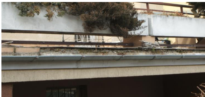
Fig 1. Example of view of the technical condition the front a terrace before modernization.

The adverse technical condition of the structure qualifies it for repairs due to number of damages caused during construction or exploitation of the building. After the site investigation and actual condition assessment, the next step will be repairing the damages. Figure 2 presents structural scheme of the terrace.