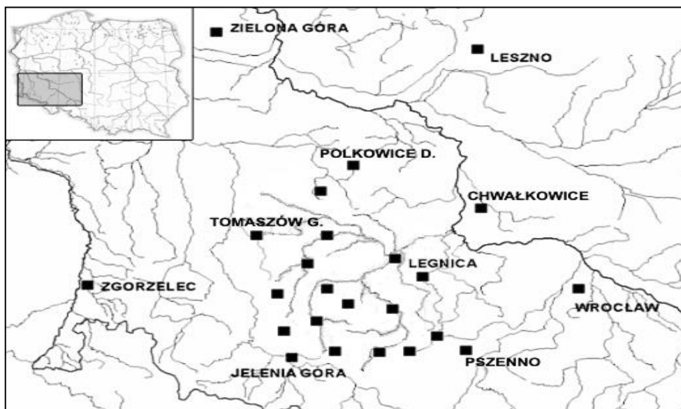
Fig. 2. Area of study – south-west of Poland, approximately 65000 km 2 .

The data simulation using the scheme (Fig. 1) was applied to a south-west region of Poland in the basin of the Odra River accounting for the area of approximately 65000 km 2 (Fig. 2). Daily data of solar radiation, maximum and minimum air temperature, and total precipitation of a 35-year data series (1981–2015) of the meteorological network within the study area, were obtained for 24 stations from the Institute of Meteorology and Water Management National Research Institute (Table 1).