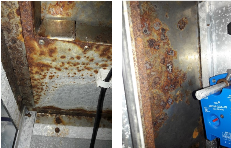
Fig. 3. View of the inner surface of the unit's side panels.