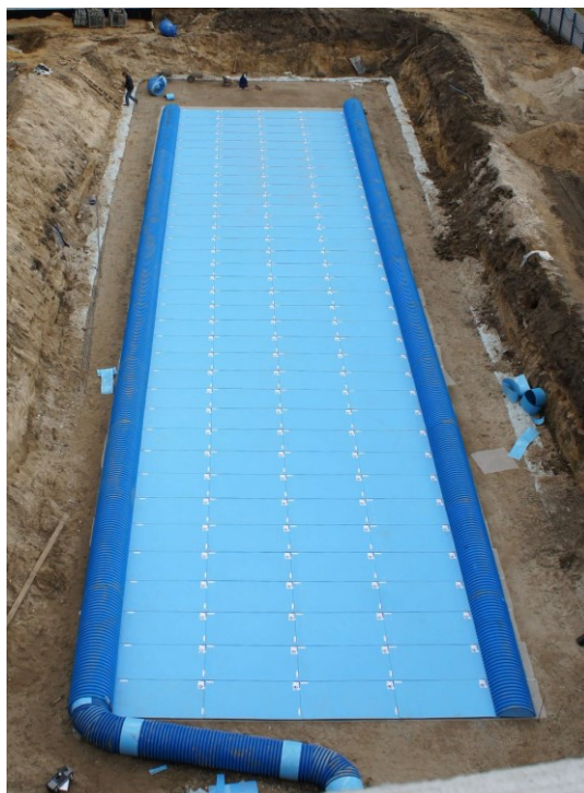
Fig. 7. Suggested solution of a ground-coupled heat exchanger [10].

At the same time, installing a ground-coupled heat exchanger outside of the building was suggested, through which fresh air drawn in by the field intake from the building's surroundings would be introduced into the ventilation system. An example of a ground-coupled heat exchanger is shown in Fig. 7.