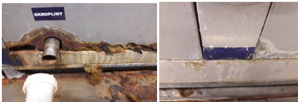
Fig. 1. View of the external cover panels of the air handling unit (air handling unit 1).

The studies assessed the state of the air handling units. A visual inspection of available internal and external structural elements of both ventilation units showed significant corrosion damage, which negatively affects both the quality of air entering the pool hall and the life cycle of the installation itself [7]. Heavy surface damage and material losses were observed at the bottom of the cover panels made of aluzinc-coated metal sheet. White (corrosion of zinc) and red corrosion products were present on the surface of the cover panels-degradation of the coating (Fig. 1-2).