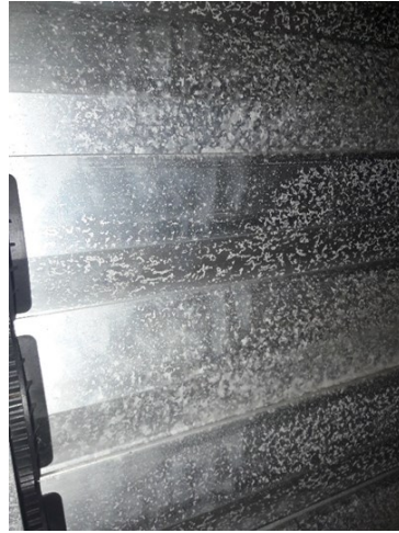
Fig. 5. View of the damper blades' surfaces made of aluminum in unit 1.