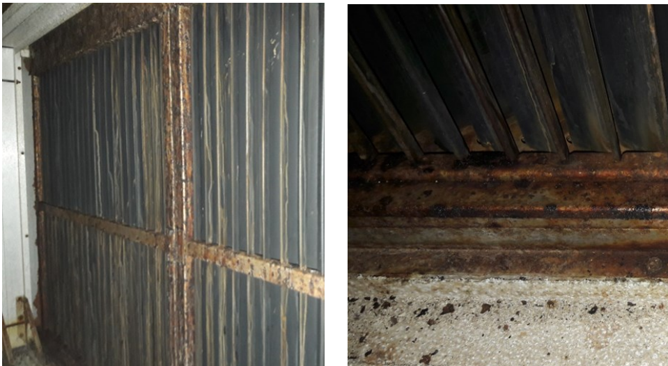
Fig. 6. View of the evaporator area in unit 1.

The analysis of the available documentation showed that in the initial stage of operation of the ventilation unit, the construction of the wall air intake did not ensure adequate protection of the unit against the influence of weather conditions. The lack of a protective roof has caused an additional amount of water coming from atmospheric precipitation (rain, snow) to enter the intake duct. The water excess (rainfall and moisture from the air removed from the pool hall) was not sufficiently discharged from the condensate tray of the ventilation unit, which resulted in overflow outside the tray. The lack of the possibility to drain the excess water contributed to premature damage to the floor panel surface.