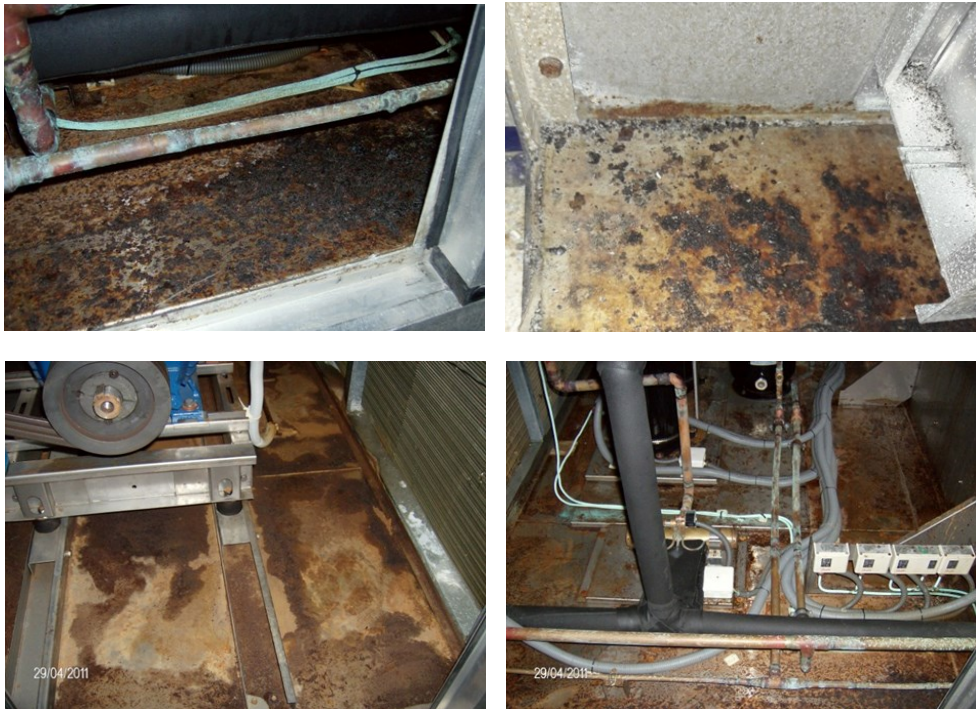
Fig. 4. View of the inner surface of the unit's floor panels.