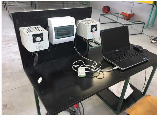
Fig. 6. Frequency converters LS - iG5A series and fuse strip