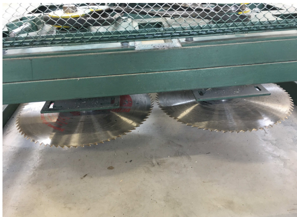
Fig. 4. Discs