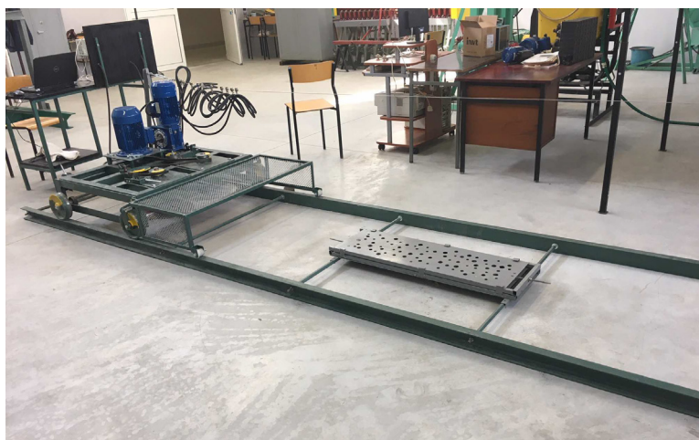
Fig. 3. A truck with drive and cutting units

For the station drives a three-phase motor, Tamel 3SK6100L-2, with rated power of 3 kW was used (Fig.3).