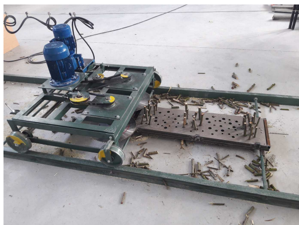
Fig. 5. A base for placing the samples

Two frequency converters LS - iG5A series are responsible for controlling the rotary speed of electric motors (Fig.6). The supply of motors and frequency converters as well as their switching on and off takes place through a fuse strip. The control of travelling speed of the truck with the cutting unit is effected by changing the frequency of the current realized by means of the frequency converter located on the left side of the control board (Fig. 6). Changing the current frequency and switching the motor on and off is effected directly from the frequency converter with the use of a special keyboard.