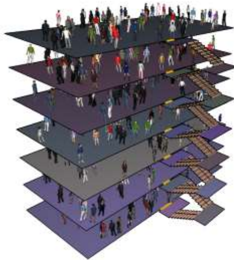
Fig. 1. The simulated building.

The calculations of the evacuation time and the human flow density were made in PC Pathfinder. The program algorithm is based on an individually-streamed motion model [18, 19], which takes into account the possibility of manoeuvring and movement slowing down. Since there is no the human flow separation into stages (phases) at simultaneous evacuation, the density of the human flow after some time becomes uniform along the evacuation way. We accept that after the last person exits from the floor to the staircase, the flow moves with a constant maximum density over time. In connection with the foregoing, the modelling of a high-rise or multi-storey building does not make sense. For clarity, we model the 7-storey building and consider the evacuation of single staircase part of the building. The evacuation time was calculated during the movement on the stairs. The time step is 0.025 seconds.