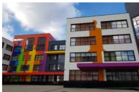
Fig. 2. Examples of incorrect construction of windows in schools and kindergartens. Lack of opening upper transoms.

It is obvious that the selection of constructive solutions for translucent structures of schools and kindergartens at the stage of their architectural and construction design should accounts the above requirements.