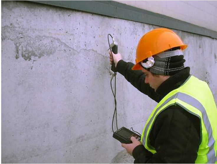
Fig. 1. Concrete testing process

The mechanism of organizational and technological operational actions has a decisive role in making decisions about the use of non-destructive testing devices and the choice of their control method. The tool, allowing to assess the validity of the use of non-destructive testing methods in the construction of monolithic reinforced concrete structures of civil buildings and structures is missing today. Such a tool can be developed with the help of organizational and technological solutions and the formation of the parameter P_{n.c.} . "The organizational and technological potential of using non-destructive testing methods in the construction of monolithic structures of civil buildings". This concept is a comprehensive indicator of the effectiveness of organizational, technological and managerial measures when it is determined at the very beginning of a construction project. And it allows you to give an intermediate assessment of the effectiveness when considering the completed project. [2]