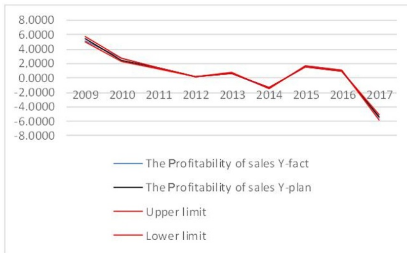
Fig. 2. The boundaries of the interval of the profitability of sales.

To compare various coefficients of the equation, we will use the relative strength of the relation — the elasticity coefficient, which shows how to change the result when you change the factor to 1%. The calculated values of the elasticity coefficients are presented in table 2.