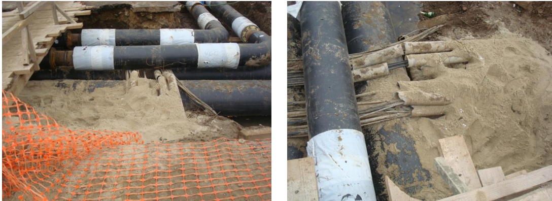
Fig. 1. The intersection of heat pipelines by other communications.