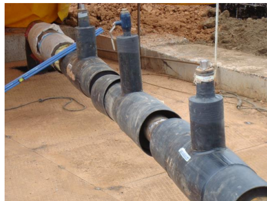
Fig. 4. The use of cutting pieces of pipe on one of the pipelines.

provoke improper installation of heat-shrinkable couplings. According to All-union State Standard, the length of the pipe supplied from the manufacturer is 10 or 12 m.