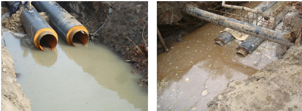
Fig. 2. Laying heat networks in a non-channel way with a violation of technology.

burns, or to more serious consequences, as happens in some cities [5, 6].