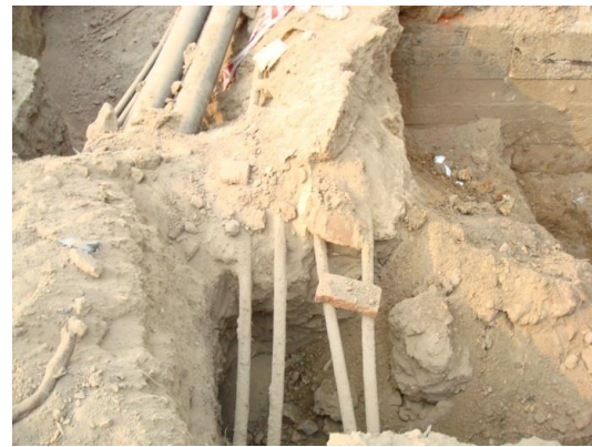
Fig. 3. Detected power cables not marked on topographic survey.