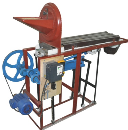
Fig. 1. Installation for heat processing of grain

An installation for the heat treatment of grain (Figure 1), which can be used for drying grain and for its thermal disinfection, is proposed [2].