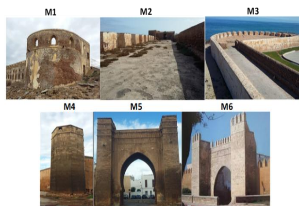
Fig. 3. Images of the alternatives on the Salé enclosure.

The intervention on these historic monuments takes into account the criteria or degradation factors that influence the overall objective of this intervention.