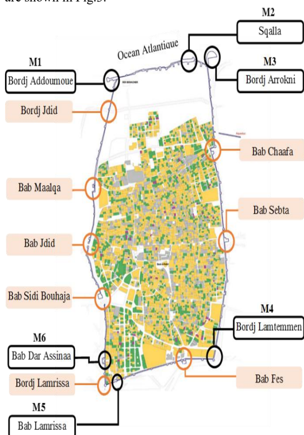
Fig. 2. Situation of the alternatives on the enclosure.

The location of these alternatives is shown on the map of the city, fig.2. Their names are :BordjAddoumoue (M1), Sqalla (M2), BordjArrokni (M3),BordjLantemmen (M4), Bab Lamrissa (M5) and Bab Dar Assinaa (M6).The photos of these monuments are shown in Fig.3.