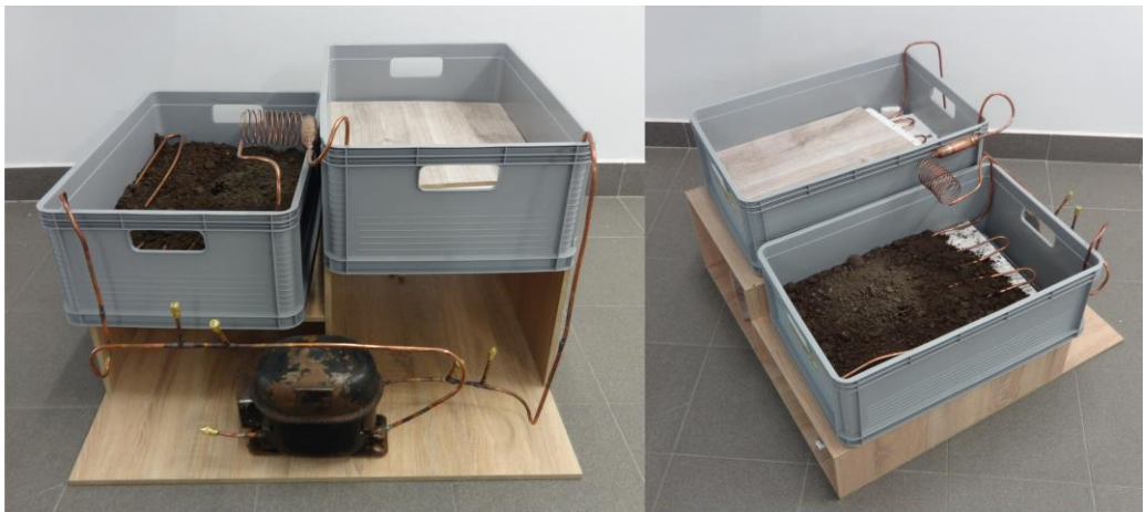
Fig. 3 Didactic rig at the end stage of construction