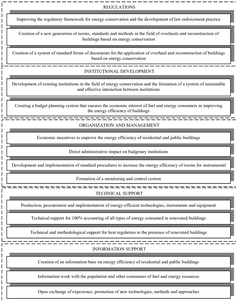
Fig. 1. The main ways of increasing the efficiency of overhauls and reconstruction of residential and public buildings based on energy conservation.

According to their place in the operational cycle, we divided energy-saving measures into those that can be carried out as part of daily operation and maintenance, and those that can only be carried out as part of an overhaul, modernization or reconstruction of the building. The latter are always referred to as long-term categories [5, 6]. The full classification of energy-saving measures for residential and public buildings proposed by the author is presented in Fig. 2.