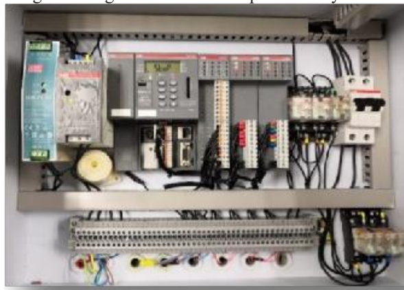
Figure 2. Control module diagram

current of the two generators is controlled by the pulse width modulation signal (PWM). , And then control the voltage and target current ratio output of the system.