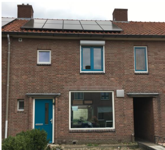
Fig. 2. Case object 2

After the renovation, two co-heating tests were applied to all three case objects: one directed at the entire building, and one directed at the warm compartment. The airtightness of the building and warm compartment were measured prior to and after each co-heating test, by means of blower door tests.