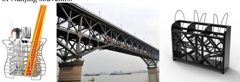
Figure 4. Nanjing Yangtze River Bridge and its Kitchen Chopstick Storage Basket

The new tourist souvenir design takes advantage of the structural similarity between the Nanjing Yangtze River Bridge and the kitchenware storage rack.