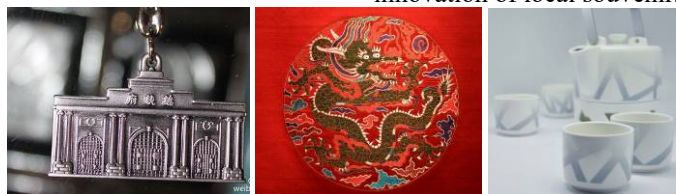
Figure 3. Presidential Palace pendant, Ming dragon brocade, Bird's Nest teapot design

However, the connotation of this cultural identity in souvenirs has gradually weakened or even lost because of the following two main reasons. On the one hand, cultural elements selected in designing are limited to the traditional historical and cultural items which are too familiar to everyone without any surprises. On the other hand, single and rigid symbolic approaches make the souvenirs completely lose their attraction to tourists. As a result, consumers lose their desire to buy.