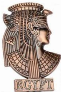
Figure 2. Pharaoh Refrigerator stickers

With the development of the times, people's aesthetic taste has changed tremendously, and there are more expectations for new colour, style and packaging of souvenirs. For example, the refrigerator sticker with the Egyptian pharaoh's head not only meets the requirements of tourists for unique cultural experience, but also meets their potential needs for functional souvenirs, such as interior decoration, multifunction, small and portable, etc.