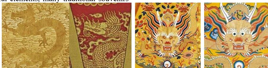
Figure 5. Ming dragon in the early, middle, late period