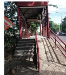
Fig. 3. Lighting in Shelter Corridor I Using Street Lighting