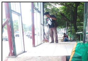
Fig. 4. Condition of The Shelter Being Cleaned