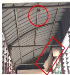
Fig. 2. The Condition of The Shelter Corridor I Without Lights