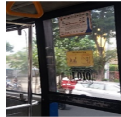
Fig. 8. Availability of Rates Information in The Bus