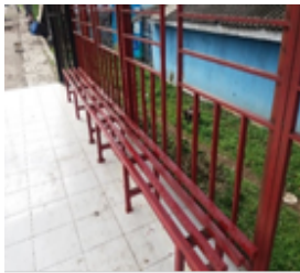
Fig. 1. Seating Conditions at The Shelter Corridor I

Lighting inside the shelter is one of the factors to improve security for public transport users [17]. Based on the results in Table 1 it is obvious that 41.4% of women consider that lighting in a bus stop is a less important variable to be addressed immediately. It is related to the operational hours of BRT services in Corridor I, which is only until 18:30 hr. Therefore, lighting in the bus stop is sufficient and does not become an important matter to be addressed immediately even if it is only obtained from street lighting.