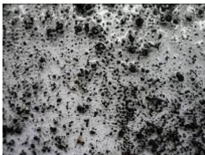
Fig. 2. Granule sludge seed

COD is an important parameter that exists in wastewater contaminants, especially in industrial wastewater [5]. Decrease in COD levels in UASB occurs when the process of producing gas in the form of H_2 , CO_2 , and CH_4 which is the result of an overhaul of organic materials by microorganisms [4].