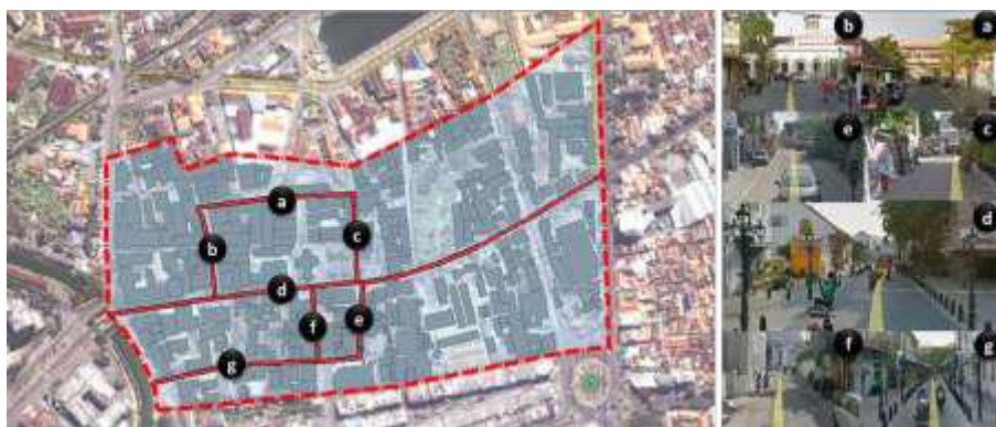
Fig 3. The existing condition of the pedestrian ways : a) Garuda Street, b) Branjangan Street, c) Srigunting Street, d) Letjen Soeprapto Street, e) Gelatik Street, f) Suari Street, and g) Kepodang Street.

According to research conducted by Aida [16], there are 3 main pedestrian activities in the Semarang Old Town area. Important activities consisting of activities moving to the workplace, which is driven by the many locations of office buildings in the Old City and surrounding areas. Other activities are optional activities in the form of historical tourism activities which can be influenced by climate and weather conditions. Then, there is a social activity in the form of community interaction, especially in public spaces such as parks.