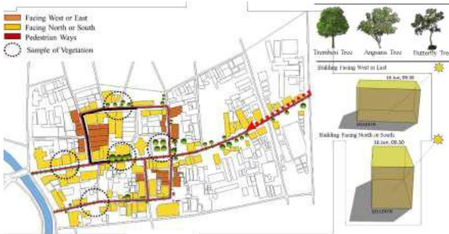
Fig 4. Vegetation and building position

on the left side at 09.30 and the right side at 17:30. In this case, the building's most advantageous position for pedestrians is the position of the building facing west or east, because the shadow of the building will cover the pedestrian ways at the highest peak temperature of 29 degrees Celsius at 09.30 am.