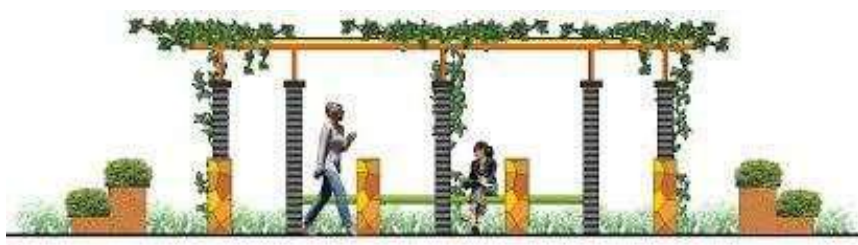
Fig 6. Pergola design