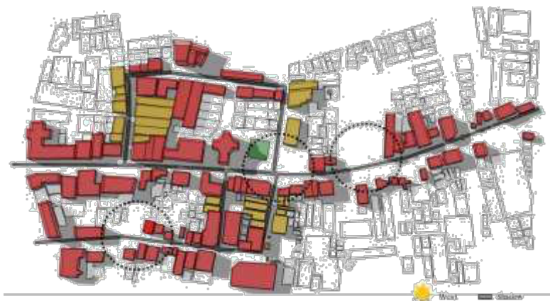
(b). 16 June 2020, time : 17.30 WIB Fig 5. Spread of buildings along a pedestrian ways