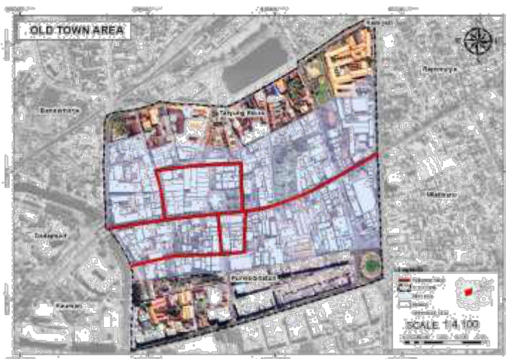
Fig. 1. Semarang Old Town Area

The Old City area is one of the crocodile reserve areas in the city of Semarang which has an area of 33 hectares and is included in the Tanjung Emas Kelurahan, North Semarang District, and Purwodinatan Kelurahan, Central Semarang District. The description of the existing conditions and territorial boundaries in the Old City area is as illustrated in Fig 1 .