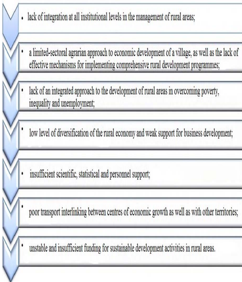
Fig. 3. Main factors hindering development of rural areas

Having analyzed the results of the programs, we can identify the main factors that slow down the development of rural areas (see Fig. 3):