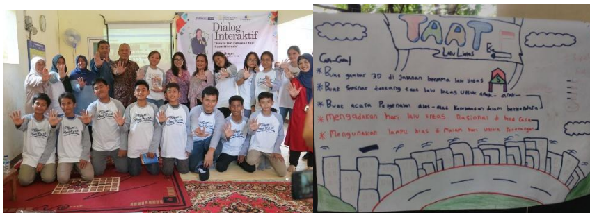
Fig. 2. Children Perception and Declaration of Children Forum

The process is not only until the planning phase by having their perception but also maintaining children's activity in the neighborhood. Strengthening children's understanding of rights and obligations is carried out with assistance by child experts, Posyandu members, PKK, and Task Force Working Group. This activity was disseminated as the preliminary stage of forming a children's forum at the RW level. Involving children in forums is a form of participation to know the perceptions and preferences of children. Below as mention in table 2 is the criteria categorized as a child-friendly RW based on it: