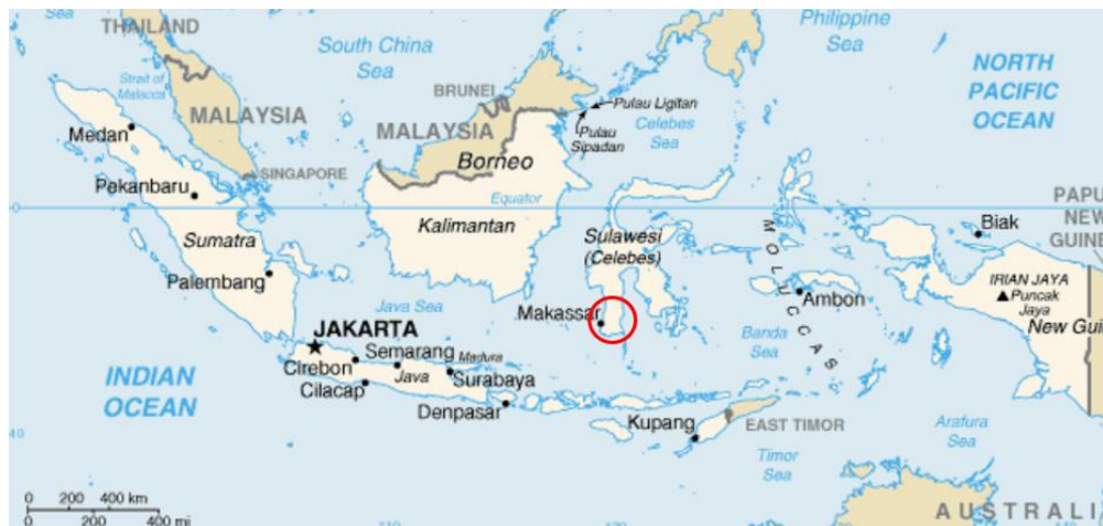
Fig 1. Location of Survey Roads in South Sulawesi as indicated by the circle, Indonesia [6]

As one of the areas with a quite congested movement between regions, South Sulawesi has the opportunity to run a traffic accident. For the road sections of this study focus, which have heavy movement, the traffic accident's occurrence is possible. Besides, it is influenced by the condition of the geometric features covering along the road section that increases the probability of traffic accidents, both on a straight or bend road, descend or upward, median provisioning, and road roughness / IRI condition. Thus, this study analyzes the significant factors of geometric road features on the fatality rate of traffic accidents in South Sulawesi, especially in the four roads, namely Jeneponto-Bantaeng, Bantaeng-Bulukumba, Bulukumba-Tondong, and Sengkang-Impa-impa.