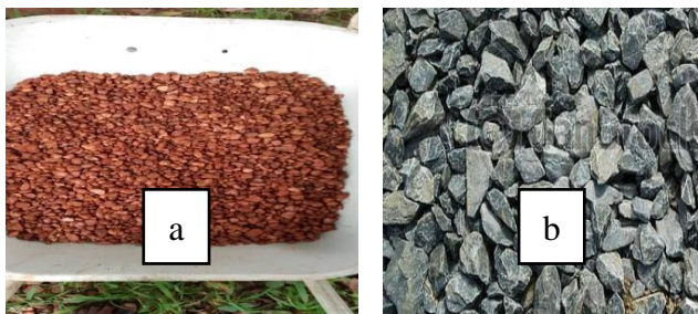
Fig. 1. Coarse aggregate: (a) Pebbles – Bida gravels ; (b) Crushed granite; Source: Department of civil engineering laboratory, F.U.T., Minna.

Hirotsugu et al. [12] reported that 15% compressive strength gain, can be achieved when fresh concrete was subjected to 1-2 hours re-vibration even though it depended on the workability of the concrete. It was further observed that improvement in the strength is more pronounced at earlier ages and is greater in concretes liable to high bleeding since the trapped water is expelled by re-vibration.