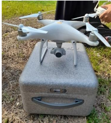
Fig. 2. DJI Phantom 4. (Personal Data)

In recording field data using a rotor type UAV [8], a DJI Phantom 4 was flown in the study area (Figure 2). Before recording, a flight path was planned using the Pic 4D application on the mobile phone (Figure 3). This recording time took 9 minutes with a flying altitude of 100 meters above ground to get detailed and precise data with a spatial resolution of 2.73 cm/pixel.