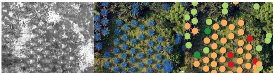
Fig. 7. The process of Vegetation Health Estimation (VARI, Extract, and Classes). (Data Processing)

Resulted from VARI values are divided into four classes: Needs Inspection, Declining Health, Moderately health, and Healthy. Furthermore, each class is symbolized by gradation colors (red-yellow-green) to differentiate healthy trees from trees that need maintenance (Figure 8). The resulting oil palm tree health map in the Cikabayan Research Farm reveals that most oil palm trees are in Declining Health and Needs Inspection. Plantation workers can directly inspect oil palm trees whose health is declining, based on information derived from oil palm tree health map. The information that comes from this study will significantly save time and effort in monitoring oil palm trees' health.