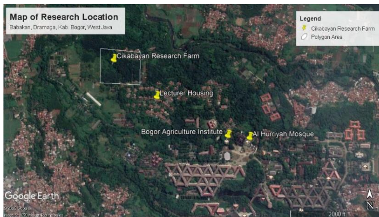
Fig. 1. Map of Research Location (Cikabayan Research Farm).

Cikabayan Research Farm is located at 6°33'5.06"S and 106°43'3.78"E. It is relatively close to the IPB University campus, close to the housing for lecturers (Figure 1). When seen in Figure 1, Cikabayan Research Farm is located north of the IPB University campus. This research farm has the largest area when compared to other research farms. Cikabayan Research Farm has around 22 hectares with a significant land area of approximately 5 hectares.