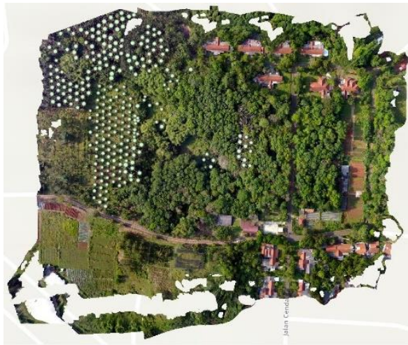
Fig. 5. Digitized polygons of all oil palm trees. (Data Processing)

The orthophoto was digitized using ArcGIS Pro software to create and manage label objects [10]. All oil palm trees were digitized to generate circular polygons based on the size, shape, and characteristics extracted from aerial photographs. Next, digitized polygons were extracted into points and saved.