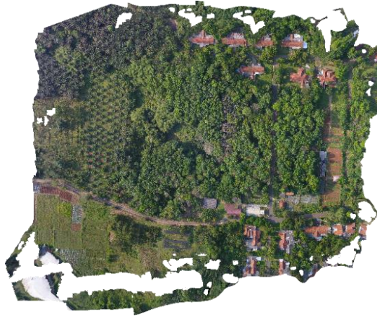
Fig. 4. The orthophoto in .tiff file. (Data Processing)