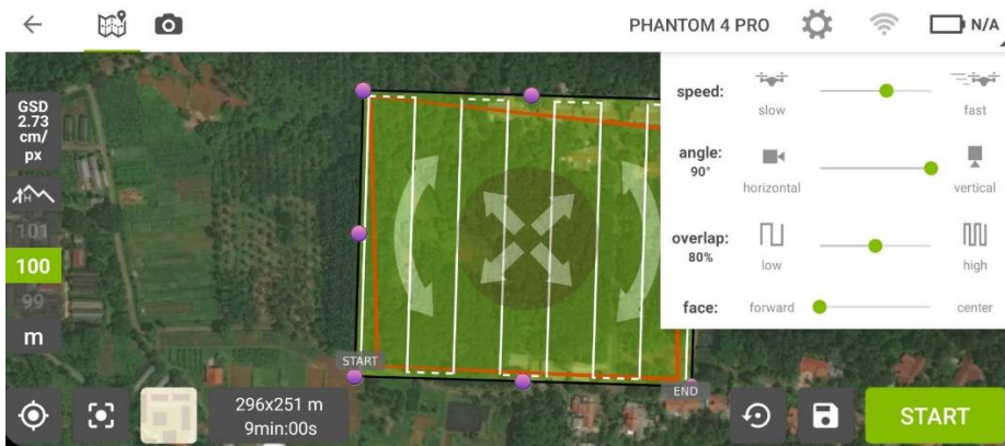
Fig. 3. Flightpath mission planning on Pic 4D mobile application. (Data Processing)