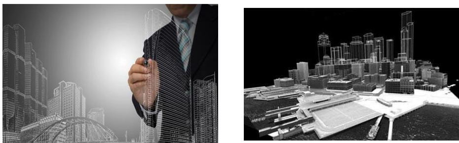
Fig. 3. Techniques and ways of forming a virtual architectural space.

The concept of virtual representation of an artistic image is based on the idea of virtual splitting up of available space through certain representations of shapes. Shapes can be permanent or temporary. They are to be identified by human consciousness and serve as boundaries between the physical and virtual environment (Figure 3).