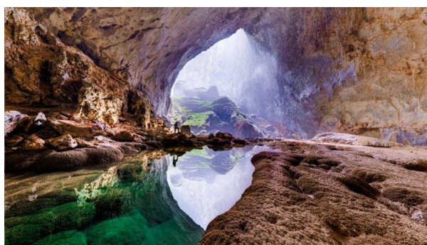
Fig. 1. Son Doong Cave

Recently, a huge tourist project suddenly sprung up in the middle of the world cultural and natural heritage area of Trang An (Ninh Binh province) without a license. The second Lady Chua Xu statue was also secretly constructed by the enterprise on Sam mountain (An Giang province). Although these works were forced to be dismantle, the damage they cause to the heritage landscape and ecosystem is irreversible [2]. Obviously, if the dialectical relationship between tourism development and heritage conservation and promotion is not seen objectively, and in a complete and clear manner, the tourism development will only bring short-term benefits but cause long-term consequences [4].