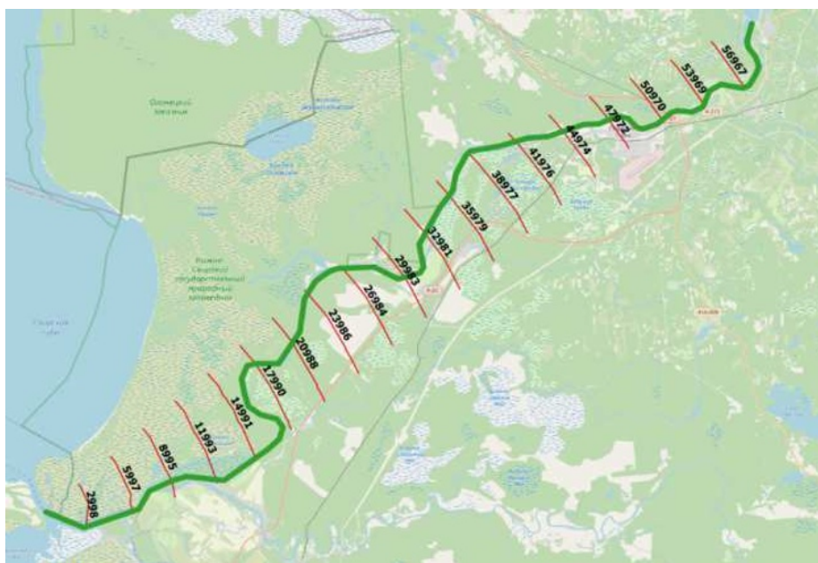
Figure 3. Geocoding of the waterway section