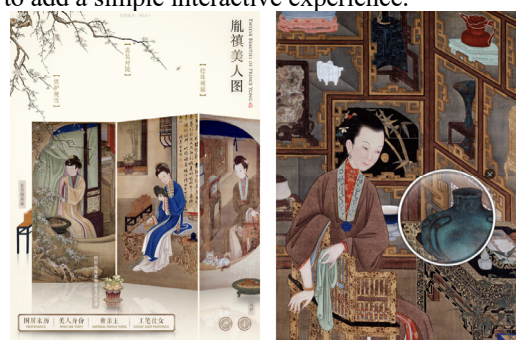
Figure 3 Interface display of Twelve Beauties of Prince Yong

as not to increase the user's interpretation of the content, just to add a simple interactive experience.