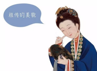
Figure 2 Emojis for Twelve Beauties of Prince Yong

from the original paintings, which is the practice of recreating symbols. The text symbols are usually network buzzwords or very colloquial content, while the visual symbols are adapted from exaggerated and funny expressions and actions of Twelve Beauties of Prince Yong . The combination of network buzzwords and visual symbols changes the original meaning of the visual symbols and expands the meaning decoding space of the original symbols, so the figures in the Painting have more cultural connotations. Emoticons are used in tweets to make them have corresponding meanings and interact with the public outside the APP, so as to promote the content encoded by topic symbols and connect with the society.