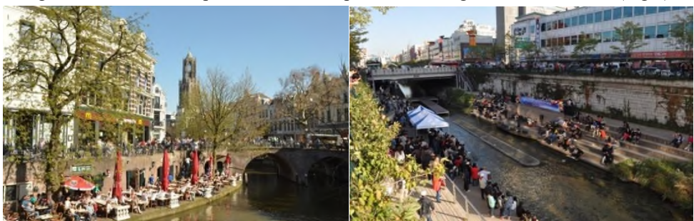
Fig. 6. Summer terraces on the canals of the city of Utrecht and a stream in the city of Seoul.

In a sense, an example of the reconstruction of canals in another city of the Netherlands – in Utrecht, where cafes, pubs, souvenir shops and other objects have been created under the embankments. Moreover, their entrances and exits are oriented to the canal with the creation of public spaces for recreation directly by the water ( https://www.theguardian.com/world/2020/sep/14/utrecht-restores-historic-canal-made-into-motorway-in-1970s ). Another indirect analogue is the large-scale reconstruction of the area near the streambed in the centre of Seoul, with the reconstruction of the streambed and the organization of a linear public recreation space with a length of 11 kilometers (Fig.6).