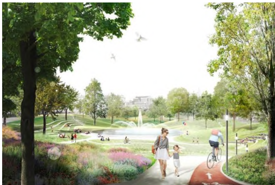
Fig. 4. Improvement proposal for the section of partial filling of the Drainage channel bed (Architectural Bureau «Tsimailo Lyashenko and Partners»).

But most importantly, in our view, what is the result on the territory of the waters of the Drainage channel and its embankments is arranged in a unique, harmonious place of citizens and tourists (Fig. 4). No noisy traffic, increasing of green space and saving water will significantly improve the environmental situation in the Central part of the city of Moscow.