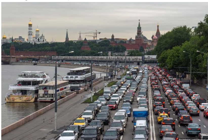
Fig. 1. Total traffic jams on the Kremlin embankment.

of a compact city). At the same time, for the central zone of the city, the problem of the shortage of territorial urban planning resources has not only persisted, but also worsened. This is due, for example, to the launch of a large-scale program of renovation of residential areas of the city, the streamlining and tightening of federal legislation in the field of establishing prohibitions and restrictions in historical zones of protection of cultural heritage and in the field of environmental protection. Despite the higher overall (compared to other districts of Moscow) indicators of provision of transport and social infrastructure facilities, in the central zone of the capital, for example, there is a clear lack of parking and public space, including green areas. The tourism infrastructure is not sufficiently developed. Even with a significant increase in the volume of construction of transport infrastructure facilities and after the introduction of parking fees, the center of Moscow is overloaded with traffic flows (Fig. 1). All this negatively affects the environmental situation, requires measures to reduce harmful emissions, noise, etc. The high density of development, the noted prohibitions and restrictions indicate the exhaustion of the possibility of traditional extensive construction to eliminate regulatory gaps in security. In this regard, as world practice shows, the problem can be solved by developing UUS (cities in Western Europe, Canada, etc.).