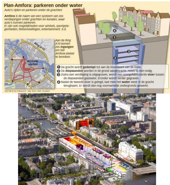
Fig. 5. AMFORA project for underground development of water bodies in the city of Amsterdam.

In a sense, an example of the reconstruction of canals in another city of the Netherlands – in Utrecht, where cafes, pubs, souvenir shops and other objects have been created under the embankments. Moreover, their entrances and exits are oriented to the canal with the creation of public spaces for recreation directly by the water ( https://www.theguardian.com/world/2020/sep/14/utrecht-restores-historic-canal-made-into-motorway-in-1970s ). Another indirect analogue is the large-scale reconstruction of the area near the streambed in the centre of Seoul, with the reconstruction of the streambed and the organization of a linear public recreation space with a length of 11 kilometers (Fig.6).