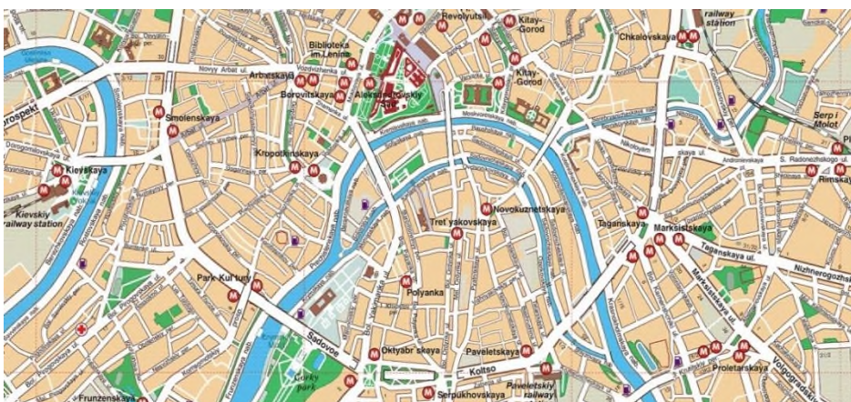
Fig. 2. Dislocation of the water drainage channel on the map of Moscow ( http://tvosibgtv.ru/events_geotechnics/koncepciya-reorganizacii-rusla-vodootvodnogo-kanala-g-moskvy.html ).

The drainage canal was laid at the end of the 18th century along the central radiation of the Moskva River near the Moscow Kremlin, thus forming the Balchug Island together with the Moskva River. The canal originates above the Bolshoy Kamenny Bridge, near the monument to Peter I, and flows into the river near the Shluzovaya embankment (Fig. 2). The canal is 4 km long, 30 to 50 m wide, and about 2 m deep. 11 bridges have been thrown across the canal, including 5 pedestrian bridges. The canal was laid along a swampy lowland (the old channel of the Moskva River). At the same time, the swamp was drained, in addition, the channel was supposed to protect the floodplain areas from floods. In the 20th century, after the reconstruction of the structures of the Moscow river basin, it lost its drainage and navigational importance. Today the Vodootvodny Canal is included in the list of inland waterways of federal or regional significance. Moving and small vessels on it are carried out chaotically without passenger state supervision over the safety of navigation. Work on waterways and activities for navigation and hydrographic support are not being carried out.