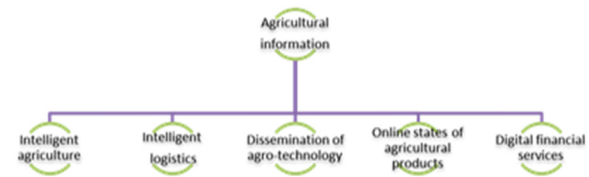
Figure 2. The Countermeasures of the Enshi's Agricultural Economic Development