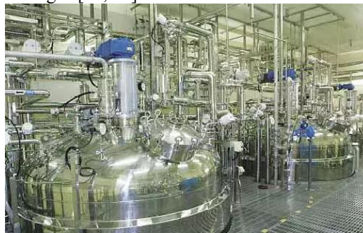
Figure 4. Devices of microalgae heterotrophic culture.

heterotrophic culture than under autotrophic conditions [31]. Many microalgae have higher oil productivity under heterotrophic conditions, their lipid content can reach up to 80% of dry weight. Microalgae heterotrophic culture is not restricted by environmental factors with a low cost. Nevertheless, heterotrophic culture requires a large amount of oxygen. In addition, oxygen supply is an important factor that limits the scale culture of microalgae [32, 33].