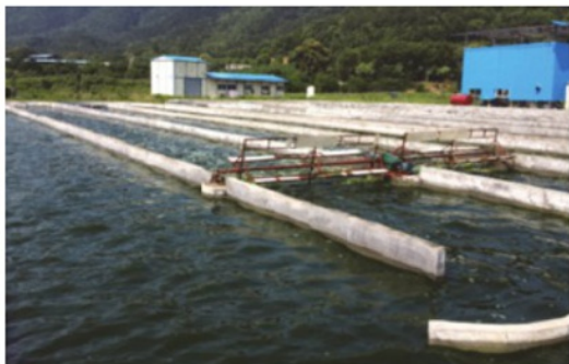
Figure 2. Open bioreactor and open raceway ponds (microalgae cultivation by Guangzhou Institute of Energy Conversion, Chinese Academy of Sciences) [28].

parameters of microalgae are easy to monitor with stable environment owing to closed characteristics. However, the construction and culture cost is higher for the closed case. Furthermore, the culture tank is difficult to clean and to be utilized for large-scale cultivation of microalgae. At present, most of the algae are used to produce high value-added products [30].