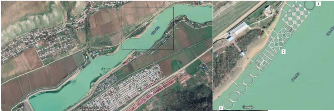
Fig. 1. Khodjикent reservoir in Tashkent province, Uzbekistan.

The Khodjикent reservoir is located downstream of the dam of the Charvak reservoir, from which water is discharged from the lower part of the dam, therefore the water in the reservoir is cold all year round. This creates the specificity of the hydrochemical state of water in the reservoir. The cage fish farm is installed along the right bank of the Khodjикent reservoir, the cages are located virtually in a straight line (Fig. 1). The fish farm grows trout in the conditions of industrial fish farming, the actual fish productivity of trout is 30 - 40 kg/m 3 [1, 2].