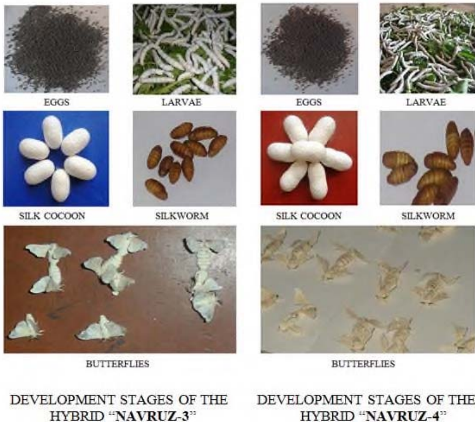
Fig. 2. Development stages of the hybrid silkworms.

As can be seen from Table 2, the test hybrids lag behind the zoned Ipakchi-1 x Ipakchi-2, Ipakchi-2 x Ipakchi-1 in terms of dry cocoon weight and length of unbroken cocoon fiber. It follows that the hybridization of breeds with inbred systems leads to an increase in the technological performance of mulberry silkworm cocoon fiber. The obtained new hybrids were tested and regionalized in production F-3x (L-51x Kit 108) (Navruz-3), (L-51xYaP 66) x F-4 (Navruz-4). Photos of the hybrids by development periods are given below (Fig. 2).