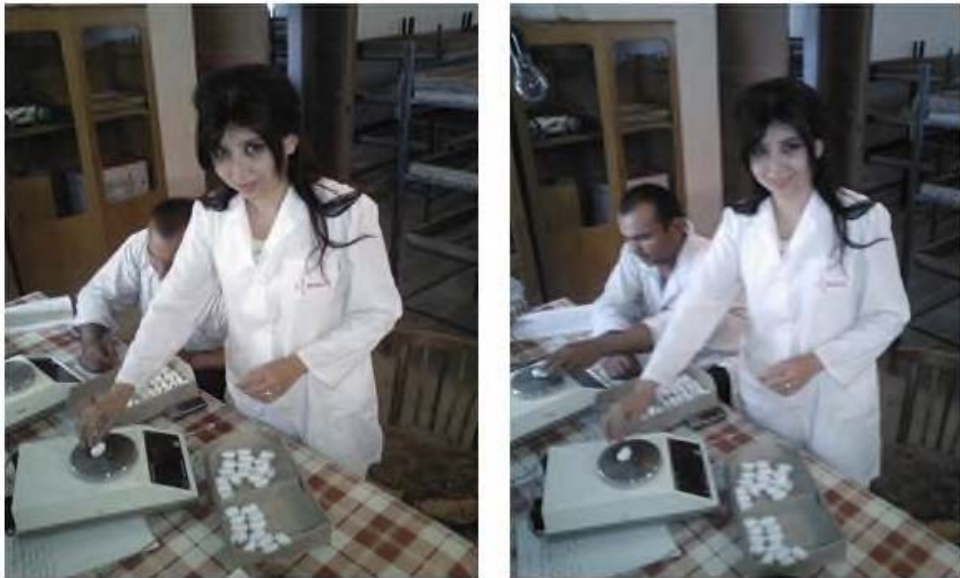
Fig. 2. Silk cocoon weighing process.

In order to determine cocoon weight, cocoon shell weight, and silkworm performance, 20 ♀ and 20 ♂ cocoons were randomly selected from each experimental variant and weighed on an electronic scale (Fig. 2). Based on the results obtained, conclusions were drawn about the biological characteristics of the gradations on the life expectancy of female and male butterflies.