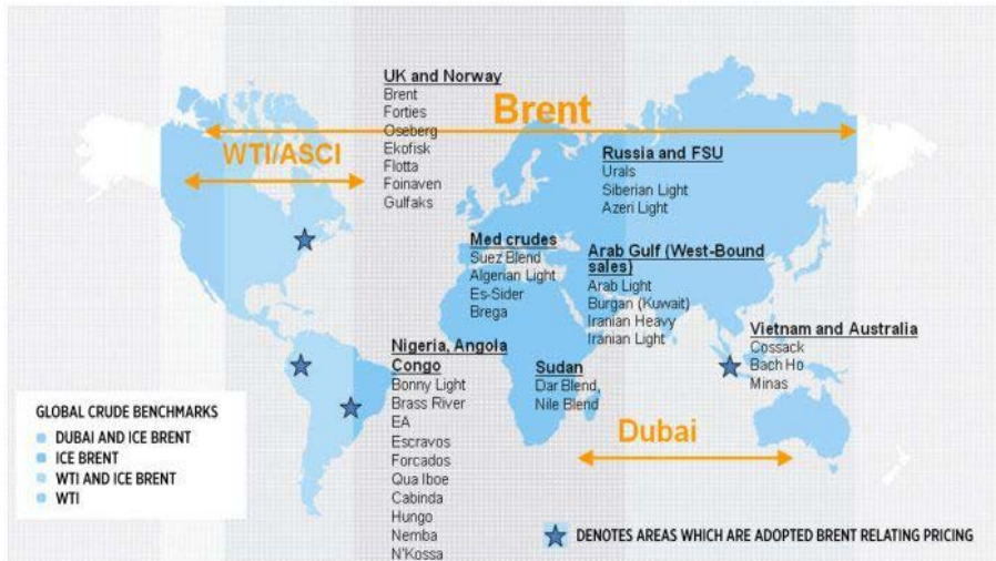
Fig. 2. World benchmarks Brent, WTI, Dubai Remark:

https://www.investopedia.com/articles/investing/102314/understanding-benchmark-oils-brent-blend-wti-and-dubai.asp .