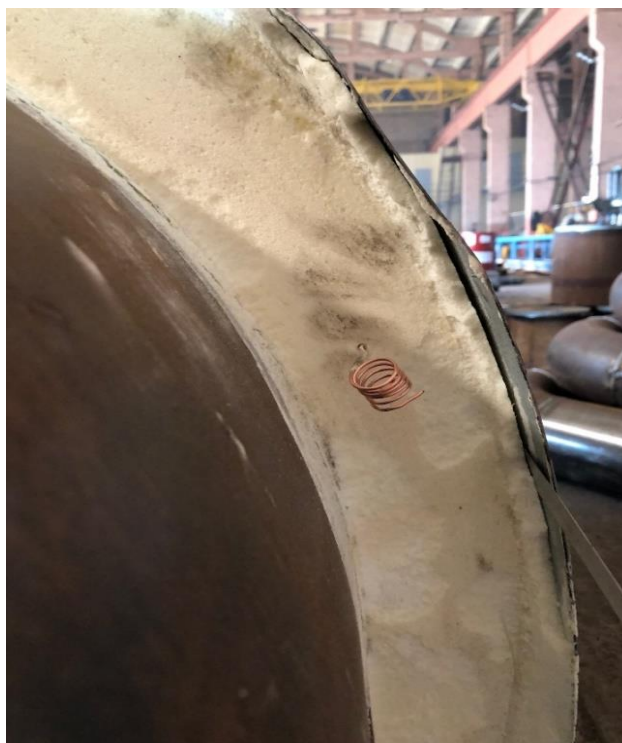
Fig. 2. Peeling of polyurethane foam from the polyethylene shell

The analysis of the results given in Table 1 indicates the need to supplement the operations and controls scope during the installation of the pipes under study, shown by the authors in Table 3.