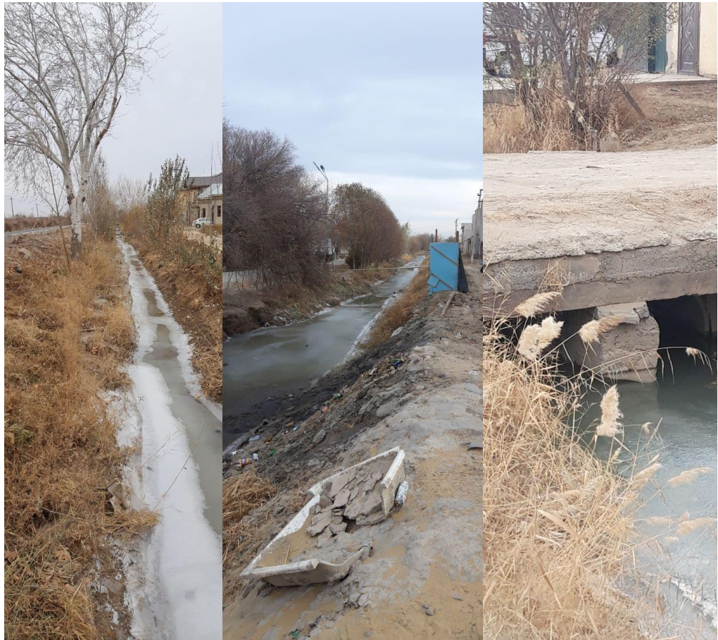
Fig. 2. Technical condition of Khumbuz canal

In addition to the above, the technical failure of the Khumbuz canal is mainly due to the failure of the canal users to maintain the water in a timely manner (see Figure 2).