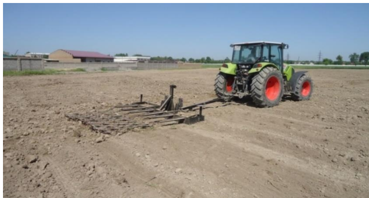
Fig. 1. Small at work

To cultivate high germination seeds and timely sowing, it is important that the load seeds are planted at the optimum depth. Seeds of a desert - pasture fodder plants need a shallow (not deep) loading in soil. Thus, researchers note that the cultivation of thistle, black saxaul, and keireuk seeds to the depth of 0.5-1.0 cm significantly increases their field germination [34]. In natural pasture cenosis, the storage of species, their change occurs due to self-sowing without human intervention, that is, without special seed placement. Wind, soil erosion, animals, etc., are those natural forces that contribute to their conservation, reproduction, change. All this happens spontaneously.